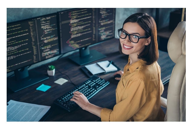
"Launch your career at Red Eagle Tech and play a pivotal role in shaping both your future growth and our client's success. Your impact starts here."