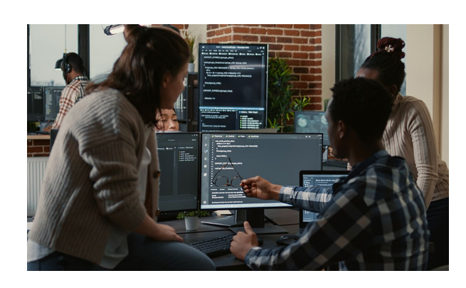
"Rapid progression based on your contribution, impact and ambition."